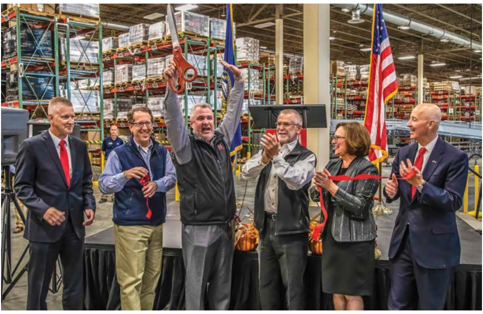
Dignitaries were on hand to open the new Hornady Manufacturing facility. Pictured above left-to-right are: Jeremy Jensen, Mayor of Grand Island, U.S. Representative Adrian Smith, Jason Hornady, Steve Hornady, U.S. Senator Deb Fischer and Governor Pete Ricketts.

and highly heat resistant, and mastic intumescent coatings swell when engulfed in flames, which slows heating of the steel. The facility includes a shooting range to test ammunition on-site as well as a new cafeteria and open office space. It is outfitted with an acoustic wall and ceiling system. The building is also equipped with an elevator, pre-manufactured metal canopies and sunshades, loading dock levelers, seals and truck restraints, a pneumatic tube system, and office space controlled with variable air volume (VAV) units. VAV systems provide precise, reliable temperature control and use less energy than other units.