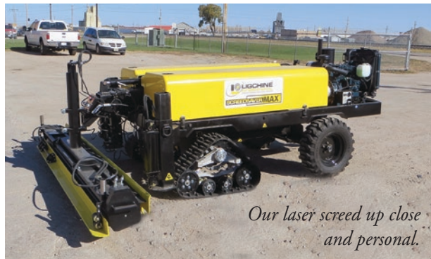
Our laser screed up close and personal.

concrete. By having such a tight tolerance on our leveling process, the rest of our procedures will improve, thus providing our customers a better finished product.