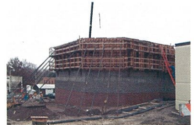
Saint Francis Varian Accelerator Addition