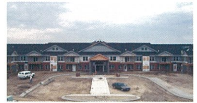
Northridge Retirement Community

Grand Island, Neb. – Nursing home renovation