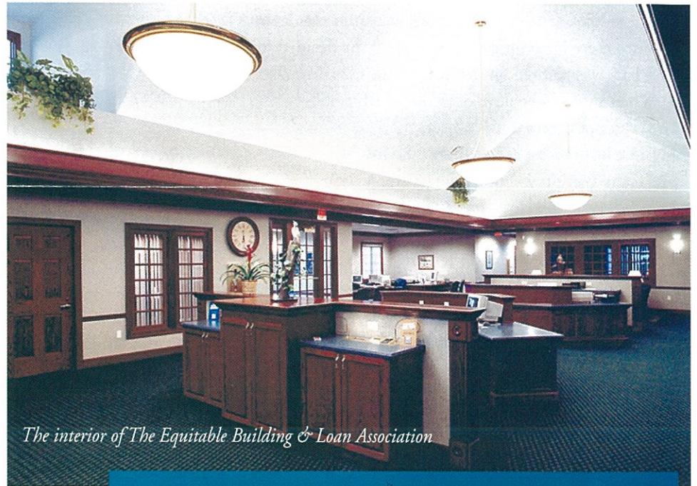
The interior of The Equitable Building & Loan Association