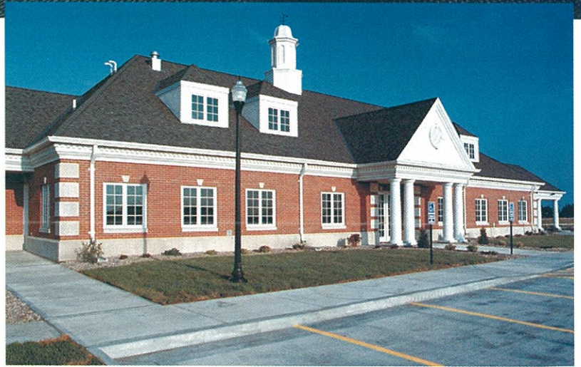
The Equitable Building & Loan Association, located in Grand Island.

"It was a natural fit when Grand Island's oldest business, The Equitable Building & Loan Association, selected Grand Island's most experienced contractor, Lacy Construction Company, for the construction of its new branch bank."