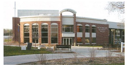
UNK Student Union completed.