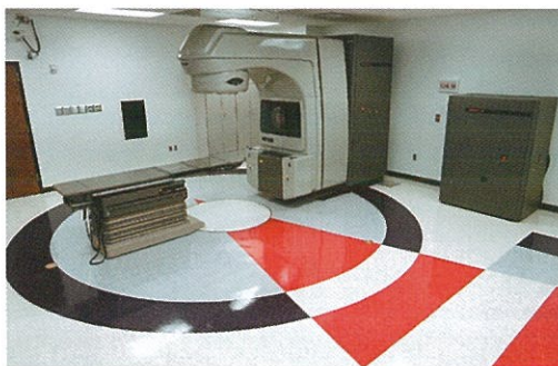
St. Francis Linear Accelerator interior complete.

The project entailed a 3,000-square-foot, two-story addition to the Saint Francis Cancer Treatment Center, located in Grand Island, Nebraska. Lacy Construction