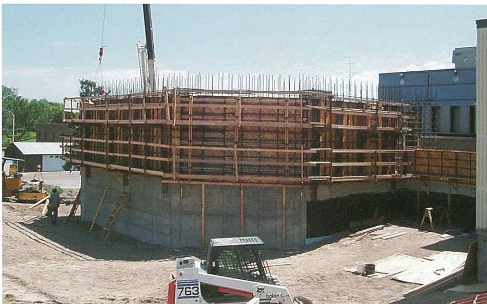
Original published photo: "Oncology third pour forming."

We bring this to your attention because we still believe this to be true, and as we begin another chapter with this issue of The Lacy Ledger , we wanted to revisit some items from past newsletters. This issue brings with it a fresh new look, and incorporates our newly adopted logo. For now, we hope you will enjoy taking a step back in time with us.