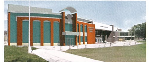
The architect's rendering originally published.

This job is a perfect example of how working together as a team can create a win-win situation for everyone involved.