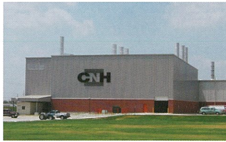
Pictured above left: CNH Paint Addition Above right: CNH Paint Addition completed.