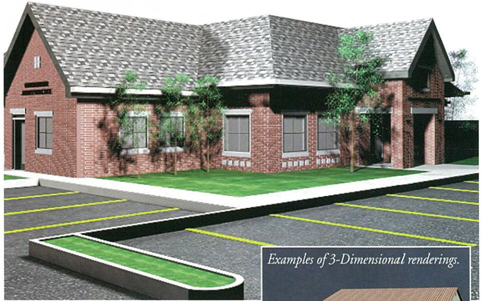
Examples of 3-Dimensional renderings.