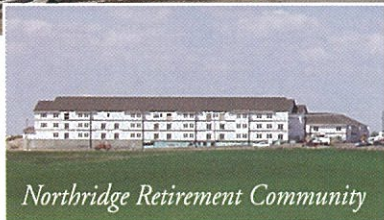
Northridge Retirement Community