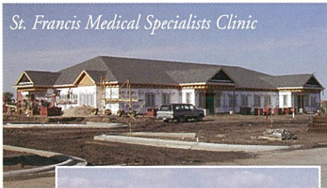
St. Francis Medical Specialists Clinic