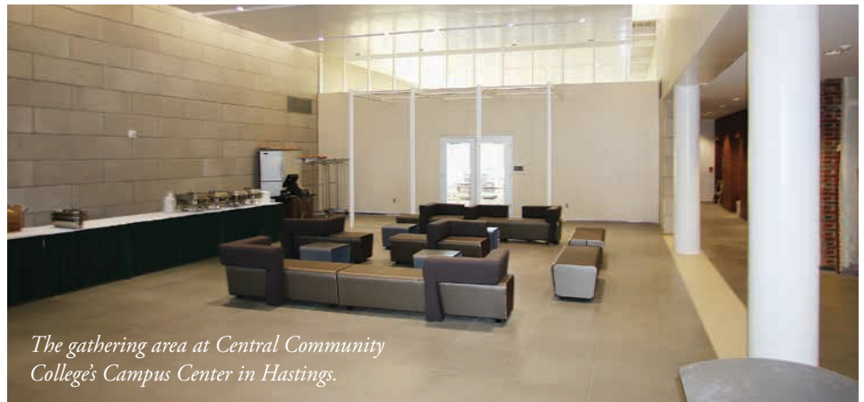
The gathering area at Central Community College's Campus Center in Hastings.

level of the Student Union has been completely remodeled to create “the place to be” if you are a student at the Hastings campus. The new Student Union includes a gaming center, a snack bar/dining center, a multicultural center, and a Veteran's Center. The ceilings include the Hastings campus signature decorative bulkheads with ceiling clouds to create great visual appeal.