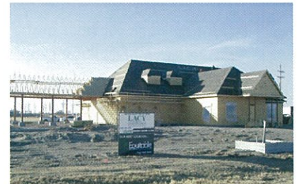
Equitable Building & Loan - to be completed July 2000