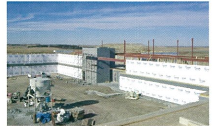
Northridge Retirement - to be completed December 2000