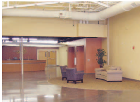
The café and coffee bar is surrounded by table and counter seating.

I wish that the Lacy Team could take all the credit, but we have to give a big thumbs up to the design team. Wilkins Hinrich Stober Architects designed a spectacular space for the church. At least two of the architects are members of the church and will get to regularly enjoy the fruits of their labor. Our hats are off to every member of the team, as that is what it takes to produce such great results. Congratulations to E-Free Church on your new facilities, and we sincerely thank you for the opportunity to serve you.