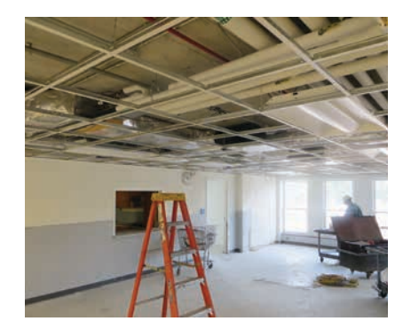
Third floor commons while under construction.

70 tons of gravel. In addition to installing the new air handling units, piping was run to move the steam and cooling from existing equipment in the basements up to the penthouses. Major electrical upgrades were also incorporated to handle the new equipment.