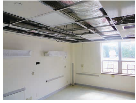
A typical resident room undergoing renovation.

Given the scope of work, the entire project will take approximately 3-1/2 years to complete, ultimately providing our deserving veterans the comfort and facilities they have earned by their sacrifices to preserve our freedom. We're proud of these men and women and highly gratified that we can serve them in this way.