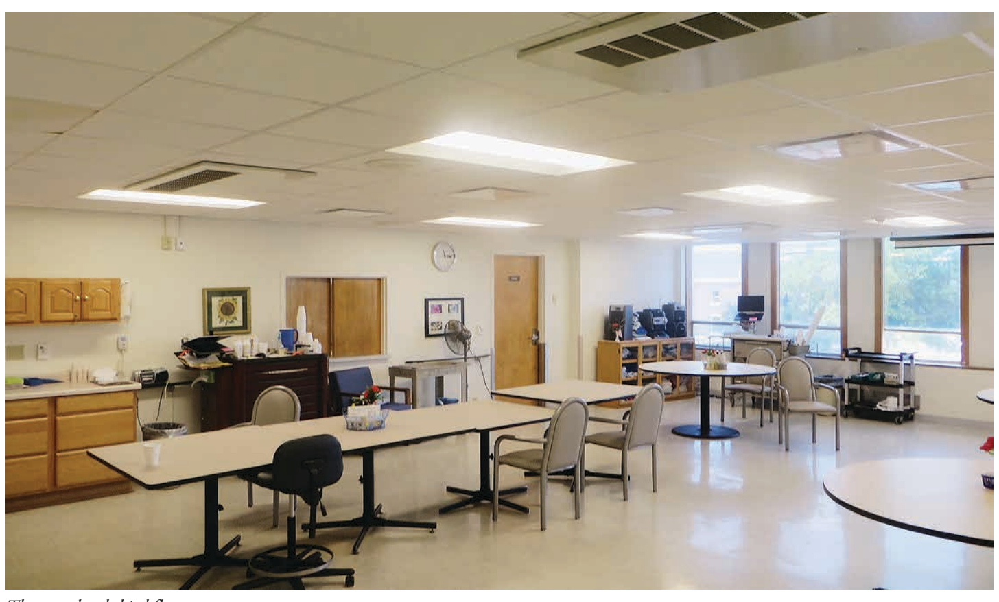
The completed third floor commons area.