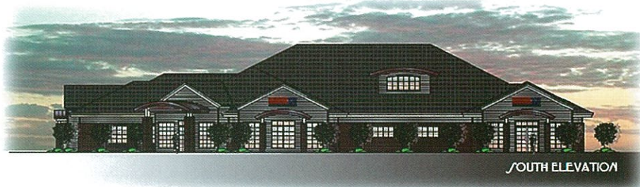
A rendering of the new Eyecare Professionals Building.

Outside, the building features red brick, giving it the "colonial" look that blends with the surrounding development. Arched "eyebrows" are used at different locations around the exterior to add a dramatic